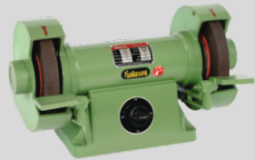
PIPE TYPE BENCH GRINDER