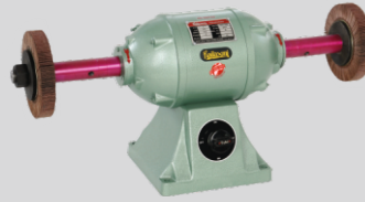
FLAP BRUCH GRINDERS