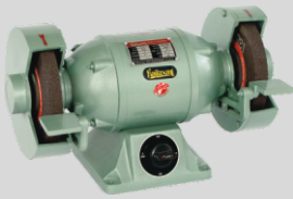
HEAVY BENCH GRINDER