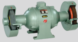
EXTRA HEAVY BENCH GRINDER