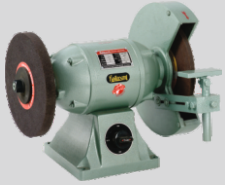
BAND SAW GRINDERS